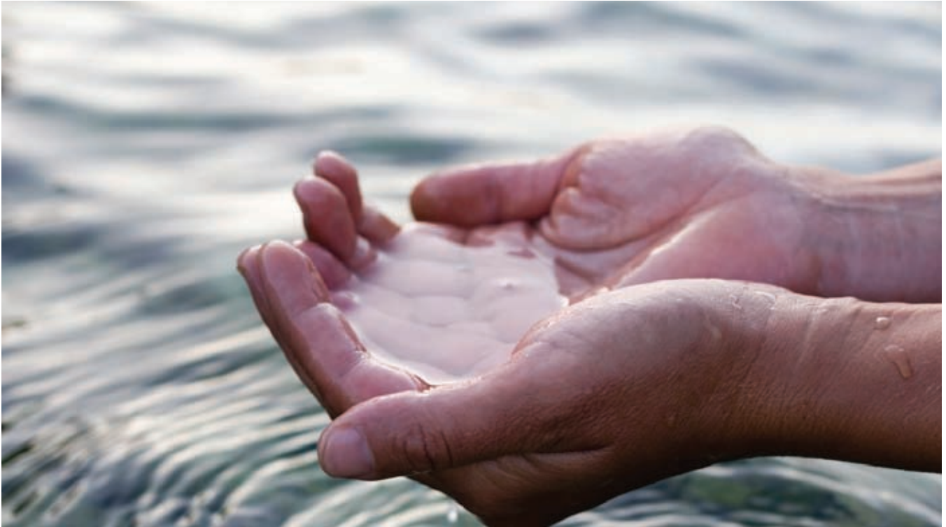
The concept of BDOs is contributing to a positive vision and a better care of the environment.

the obvious; mining companies are better at mining, whilst NGOs and other stakeholders have an edge on conservation. Without the involvement of legitimate NGOs, most BDO concepts may not gain credibility and would not be able to contribute to a social license. The involvement of international NGOs will also help to develop practical approaches to complex methodological issues surrounding BDOs. NGOs can assist in assessing and validating baselines and benchmarks, selecting appropriate “offset currency” and indicators (hectares, trees or frogs?), identifying eligible components in view of the project specific context (planting trees, capacity building or trading-up to higher biodiversity priorities?) and use of multipliers (two trees planted for each tree removed?). In many cases, responsible mining practices applying best international practice – which we anticipate to incorporate increasingly BDOs, where appropriate– are seen as the preferred development option compared to unregulated and poorly run operations. The latter includes artisanal and small scale mining (ASM), which is a longstanding and growing phenomenon in emerging markets.